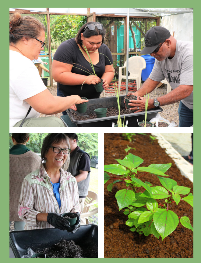
Grow Your Own La'au class participants growing lukini (lemongrass, top), and mamaki (bottom left and right).

Hilo Saturday, March 28 | 1:00pm - 3:00pm Hui Mālama Hilo Office